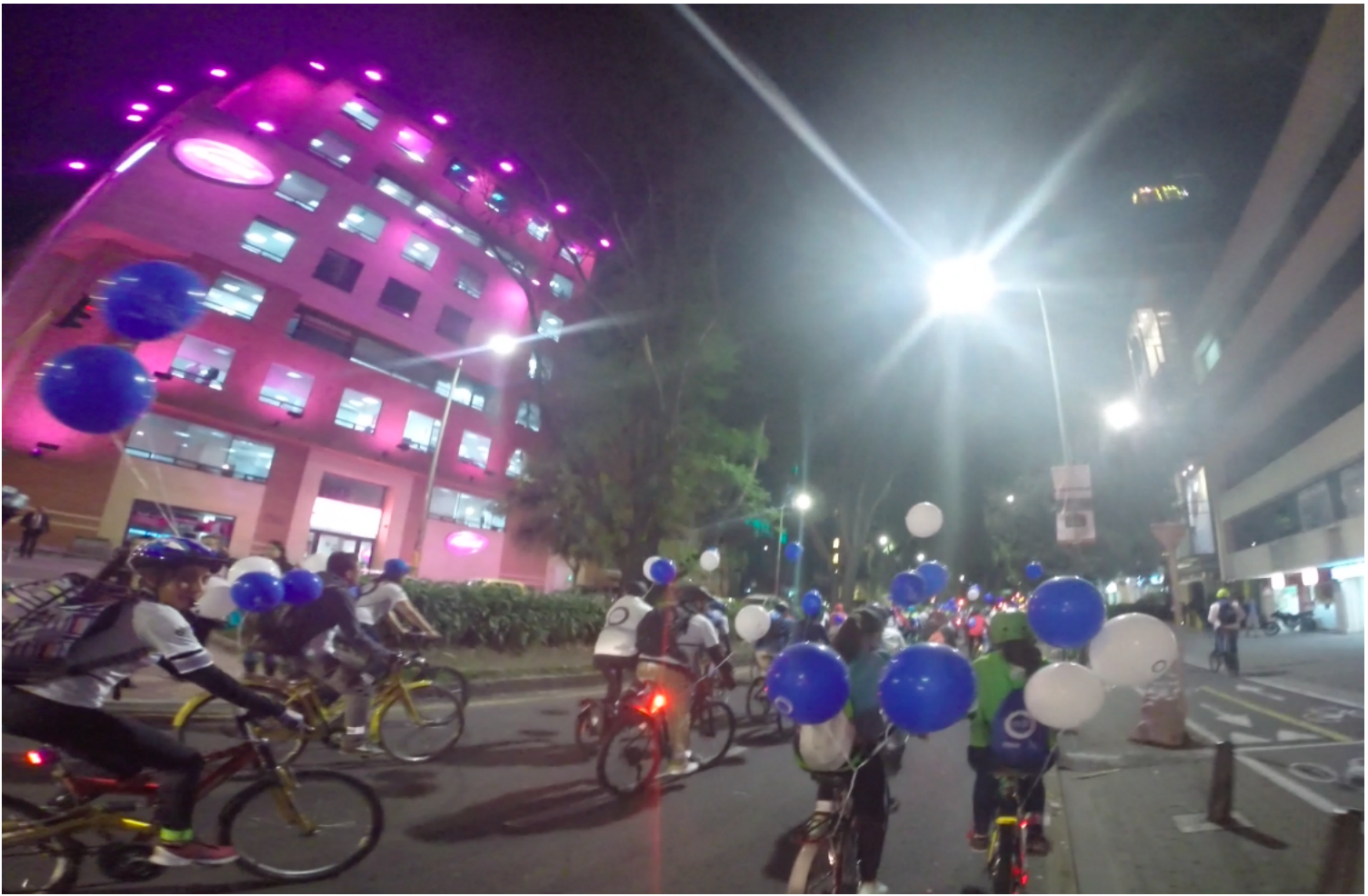
A group rides on the road, alongside an empty cycle path (right) where the large group of cyclists could not fit on 12 November 2015. While the very first groups wanted to draw attention to existing bike paths, current discourse highlights the inadequacies of Bogotá's cycling infrastructure.

I focus on one specific form of advocacy: bicycle collectives ( colectivos ) are groups of people that since 2005 have been staging weekly or bi-weekly night-time cycle rides. Colectivos are organised by individuals in Bogotá's different localities 1 , and I identified over twenty of them active throughout the city, facilitating individual participation in both affluent and working-class neighbourhoods, and often working in cooperation by staging "co-organised" rides. This promotes a sense of integration but, importantly, it also enables to people to explore parts of the city that are outside their mental map and everyday trajectories. Through social media and word-of-mouth, participants are summoned to a meeting point from which the ride departs, following a route pre-established by the organisers. Lasting between three and four hours, rides typically stop mid-way at a park or plaza for a break, before continuing on to either a final destination or the original meeting point. When the ride ends, participants divide into small groups to accompany each other on their journeys home. These activities attract between a dozen and hundreds of men and women (between 18 and 40 years of age) of varied cycling experience with the aim of riding around Bogotá, exploring the city, and re-signifying the road by filling it with chatter, music, and laughter.