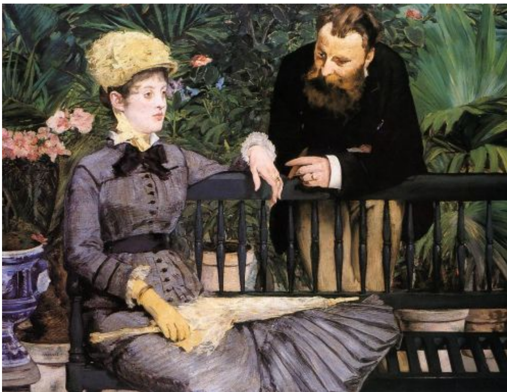
A distracted gaze

The use of vision, like the other senses, has evolved alongside technological changes. How much have histories of this affected current trends, and what may this tell us about possible futures?