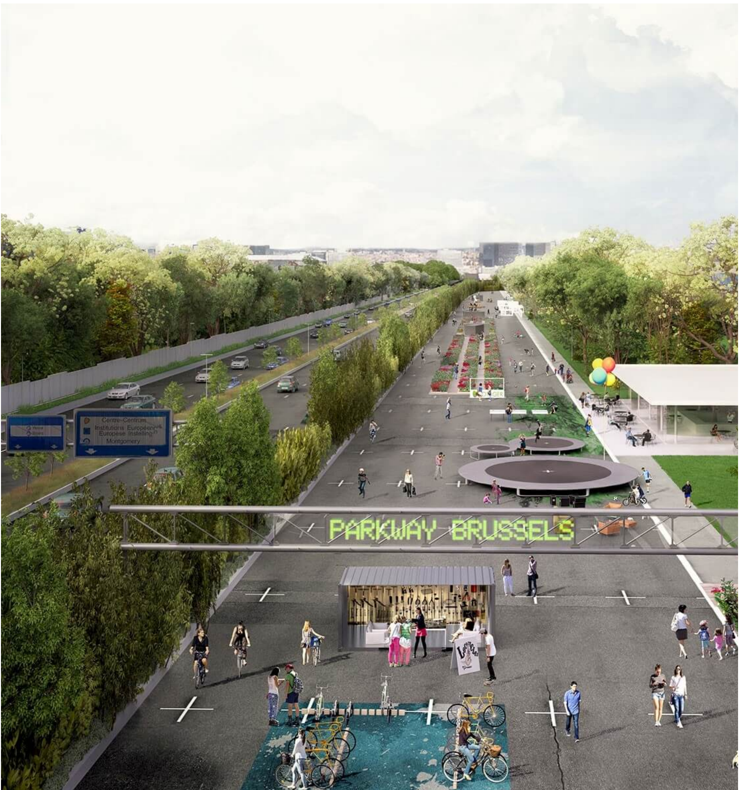
Figure 10 Urban project for the Brussels Parkway - E40, 2015. © TVK and Karbon' in association with OLM, EGIS, IDEA Consult and ELIOTH.