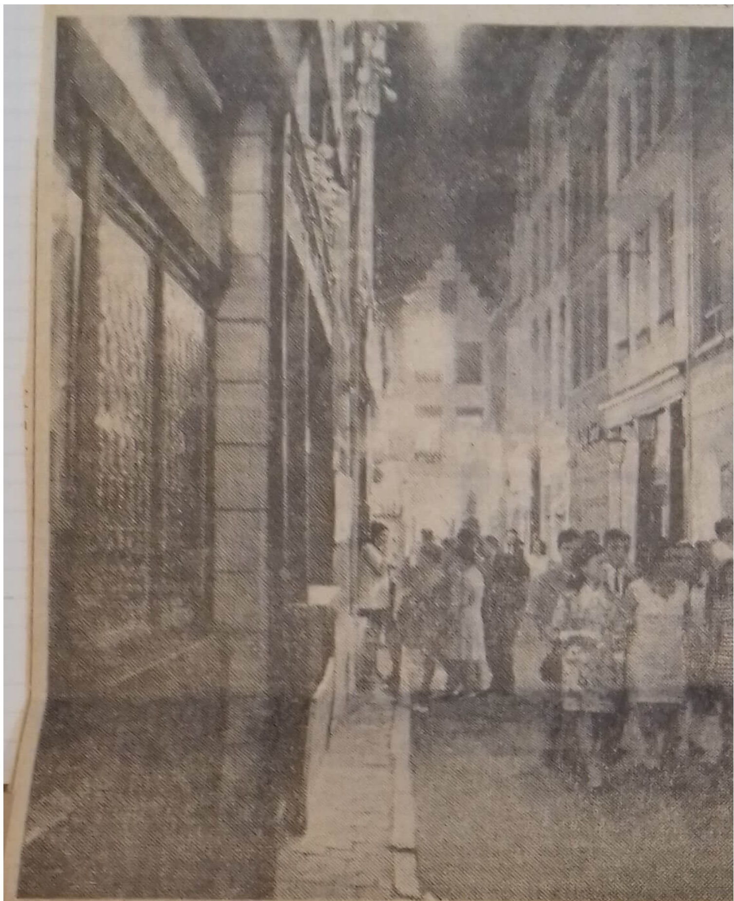
Jamais probablement, les jeunes gens qui flânent au milieu de la pet aspect de la jolie artère du vieux B