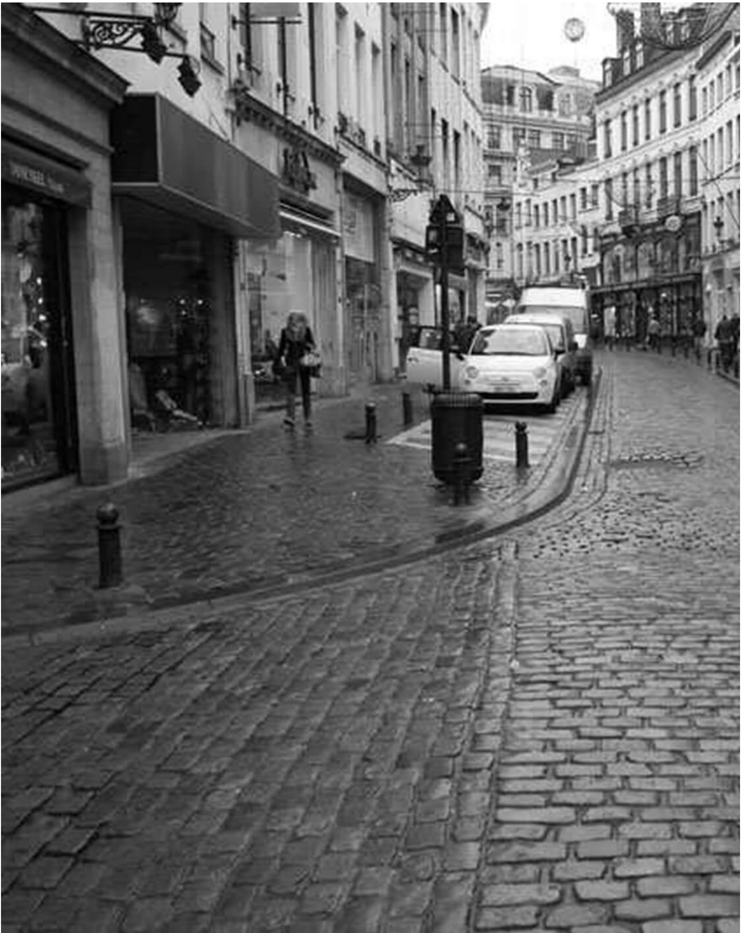
Figure 8 This section of rue Marché-aux-Herbes illustrates how the separation between speed and slowness operates, here only shown by a slight difference in the level between the road and the sidewalk. (top) This development later became a model for the renovation of all streets of the historic centre. Historical