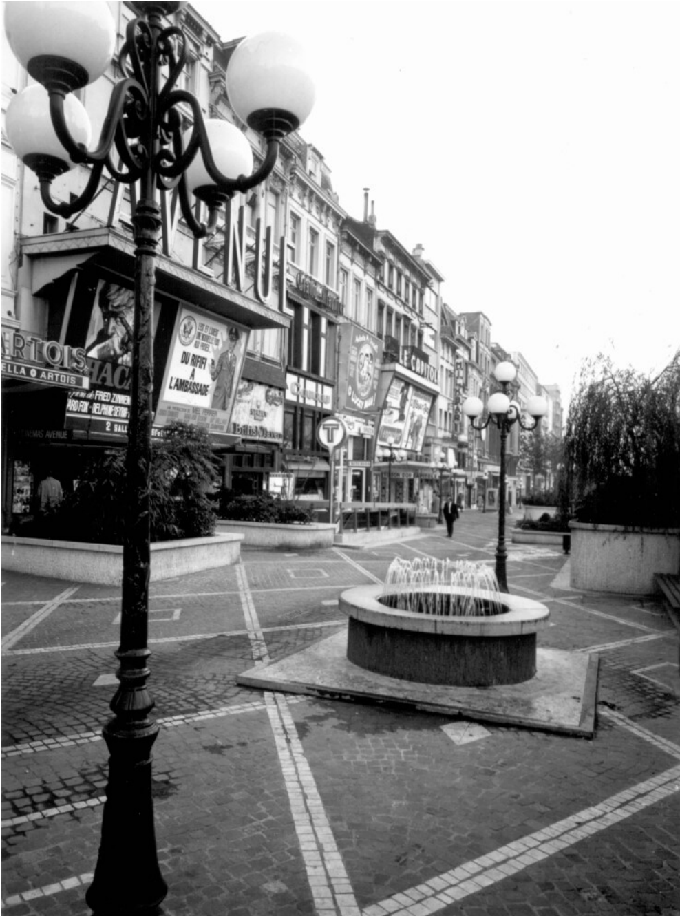
Figure 6 Avenue de la Toison d'Or, 1973.

It was in the pedestrian and semi-pedestrian spaces - surprisingly called at the time “open-air galleries” - around the galleries (Figure 6) and in the medieval city centre of Brussels (Figure 7), that a new logic appeared in the 1970s. With parking and, later, traffic being banned in order to accommodate pedestrians and defend the economic attractiveness of city-centres, the speed of cars was gradually made invisible in these particular spaces. Analysing the debates on the development of the city centre reveals how the definition of urban attractiveness slowly evolved, gradually moving away from a busy urban centre with high automobile traffic (which until then was synonymous with progress and modernity) and moving towards a more backward-looking aesthetic model, that of the idealised nineteenth-century European city described by Yves Chalas as the “city of yesterday”: “the city of harmony, the city of unity, the mineral city, the dense city, the city centre, the city of form with clear contours and a stable centre of gravity” (Chalas 1997, 242). It was the fall of the great narratives, the end of an age of ideologies that promised a better and exciting future (Ricœur 1991). We then turned to the past.