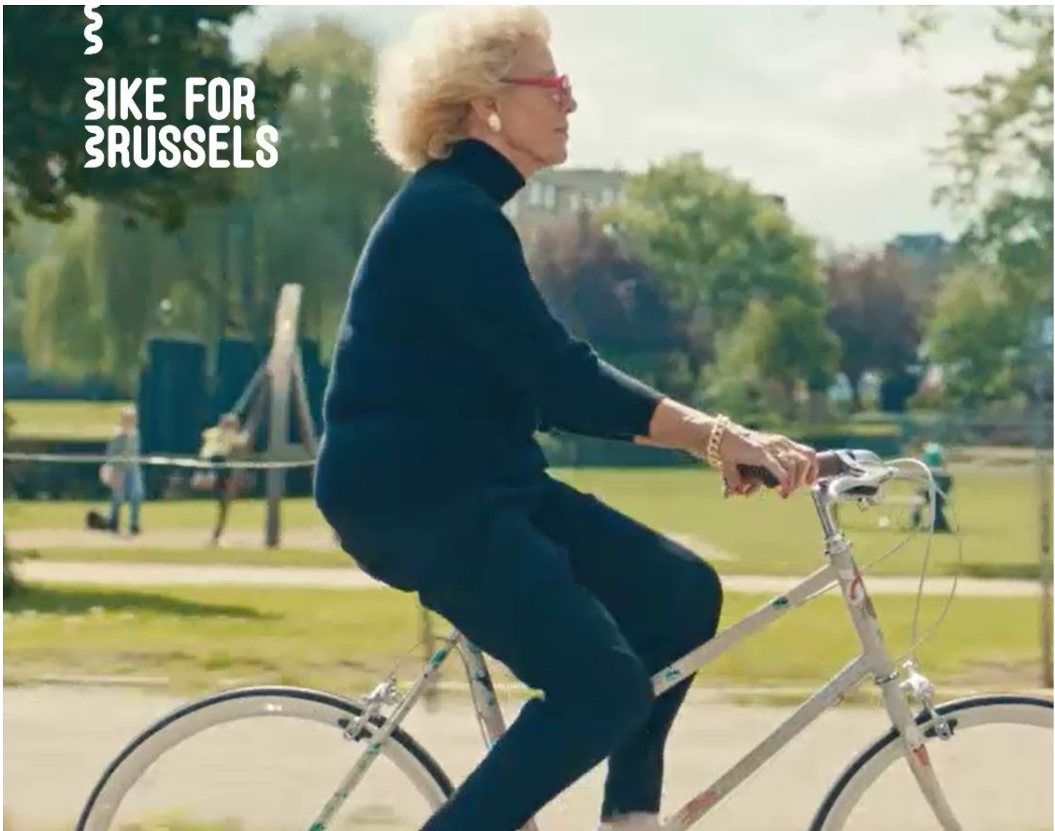
Figure 14 Photograph used as part of the “Bike for Brussels” awareness campaign, 2018.