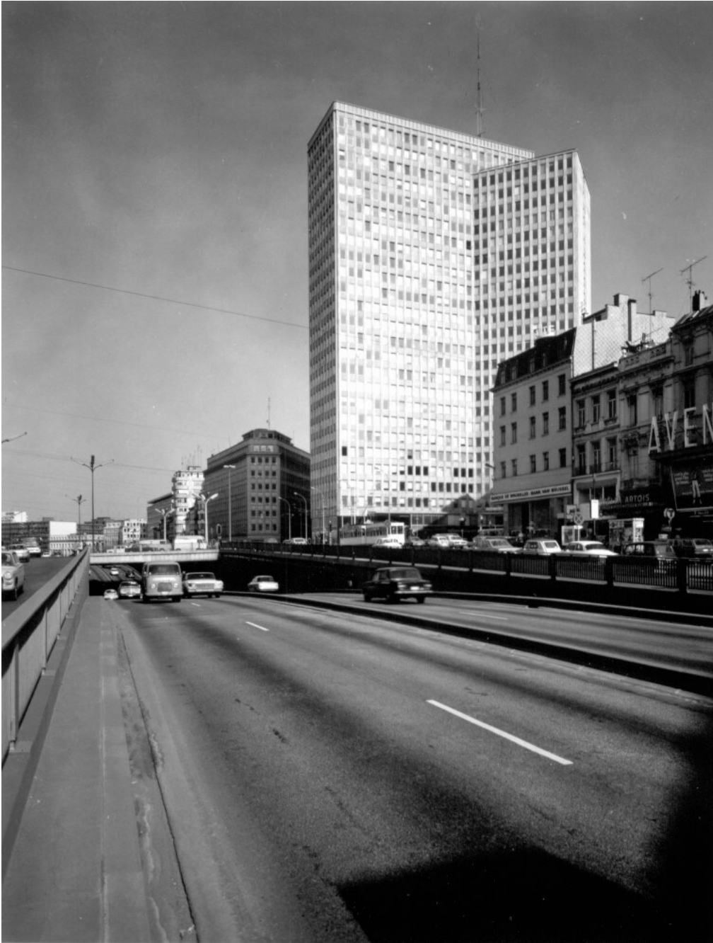
Figure 1 Porte de Namur and avenue de la Toison d'Or, 1972.