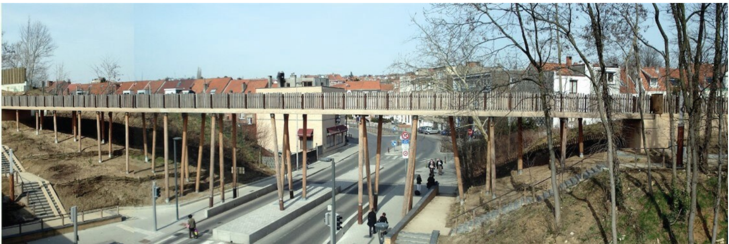
Figure 9 Example of a separate urban cyclo-pedestrian infrastructure, developed along the route of an old railway line located above the street. La Promenade du Chemin de Fer, 2010.