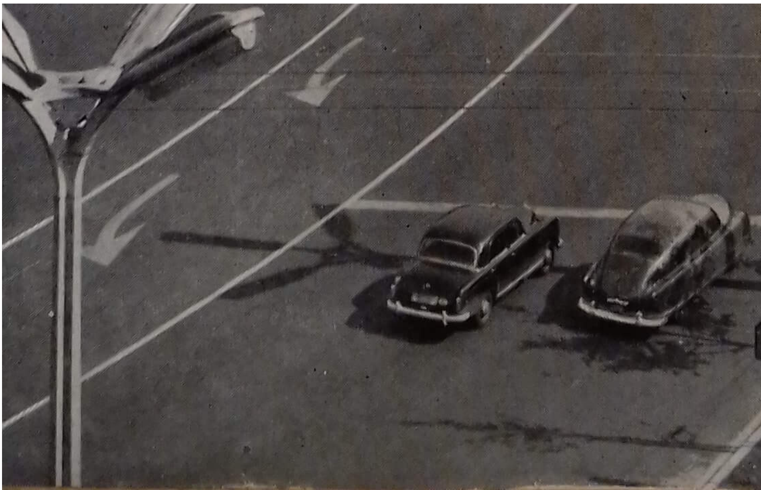
Figure 2 Motorway-type lighting on the boulevards of Petite Ceinture, 1958. © AVB, DD 529.