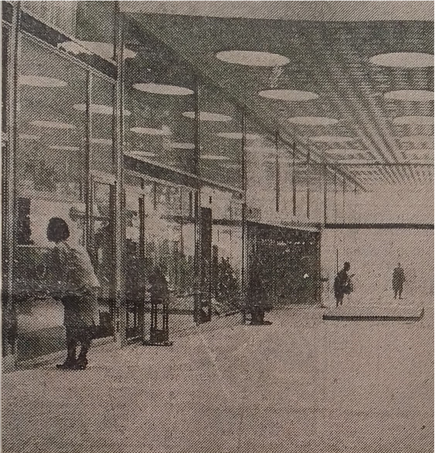
Figure 5 "The Toison d'Or Gallery accessible to pedestrians", La Lanterne, October 8, 1965.