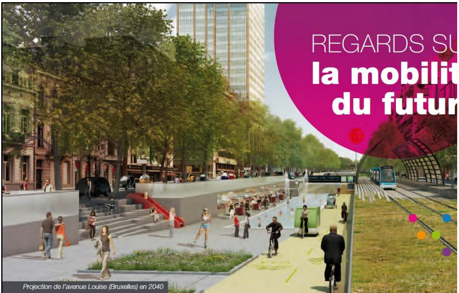
Figure 13 Projections of Louise Avenue and the Botanical Garden Boulevard in 2040. Bruxelles Mobilité, “Mobil 2040. Regards sur la mobilité du futur” [“Mobil 2040. Perspectives on the mobility of the future”], Presentation brochure, Brussels, 2014, p. 1.

(3) Its transcendent materiality. This assemblage of heterogeneous elements that is the fetish amplifies and crystallises itself through the feeling of freedom one enjoys when travelling by bicycle. In contrast to driving a car at rush hour, riding a bicycle provides a feeling of ubiquity and agility in the management of daily rhythms (the ability to get anywhere quickly and to be flexible, avoiding traffic congestion). It also offers a range of bodily sensations, linked to the physical dimension and embodied in the practice of speed (the pleasure of the physical effort and controlling the bike, the sensory perception of the wind, the sun, the atmosphere, the quality of the terrain and the landscape) (Figure 14), which resonate poetically (Sansot 1971) with cultural representations of the emancipatory bicycle. Cycling infrastructures thus become the “magical” place of an experience assimilated to the exercise of personal freedom, but also, and above all, of a particular relationship - a reconnection - to space, time and to oneself. This new fetishisation of cycling infrastructures - a hybrid of speed and slowness - therefore combines the values traditionally associated with speed (efficiency, connectivity, freedom, progress) with those more readily connected to slowness (ecology, slowing down the pace of life, engaging with one’s environment).