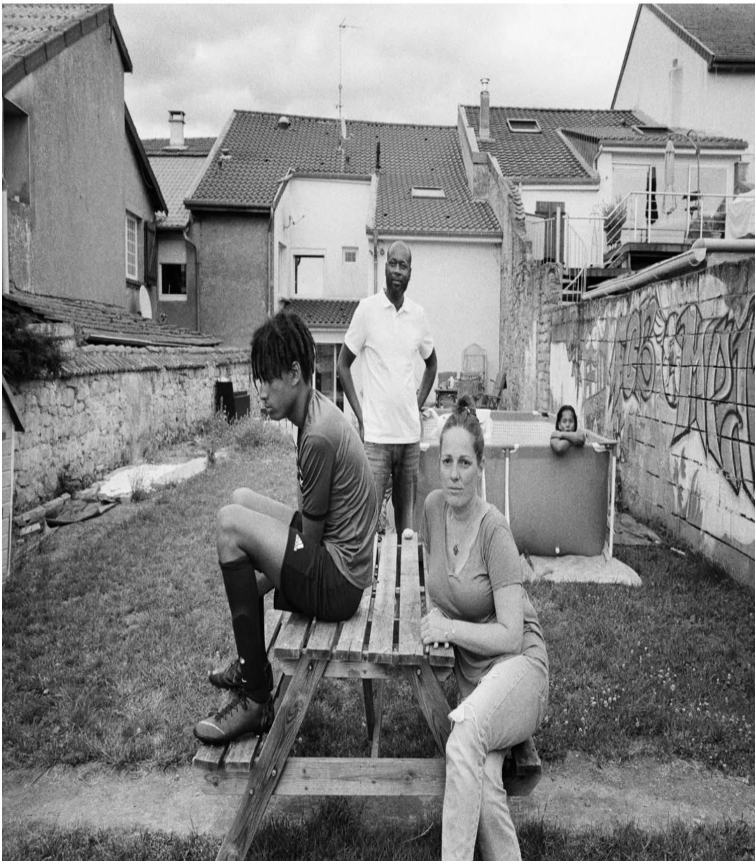
Bertrand Meunier / Tendance Floue for the Mobile Lives Forum

In this context, the Mobile Lives Forum - a think tank on mobility and its future - launched a national photographic project (inspired by the 1984 DATAR project on landscapes) to document this unseen diversity in the lifestyles of French people relating to their mobility. The Forum enlisted sixteen photographers from the Tendance Floue collective, as well as one photographer from the Magnum Photos agency, to travel throughout France and offer their vision (whether astonished, empathetic, distant ...) of the daily lives of its inhabitants. Using both digital and film, taking black and white and color photographs, they produced a wide variety of formats: large scale, video, mosaics, archives, etc. Depending on their career, artistic project and personal tastes, each photographer chose to capture the trace of one