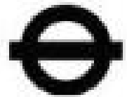
The only constant is change, by Francesco Binaggia, 2013