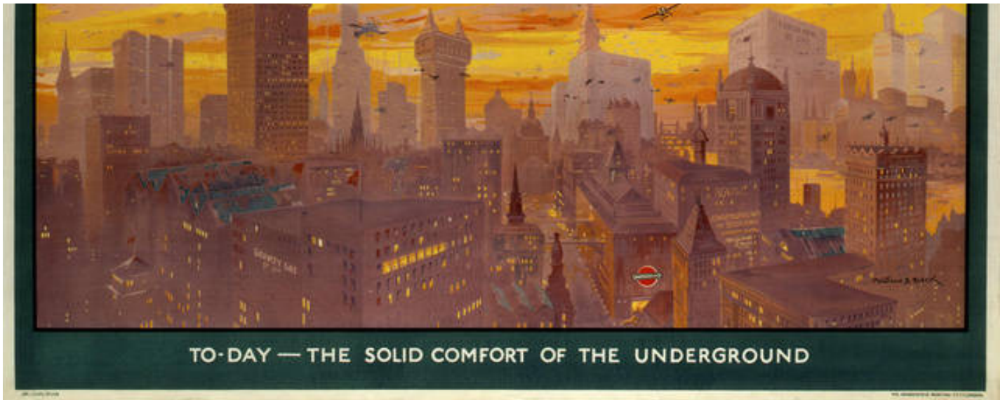
The solid comfort of the underground, by Montague Black, 1926